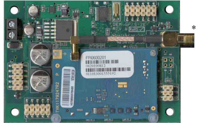
* Cable - 004 SMA Female connector cable (optional extra)

Intelligent GSM/GPRS modem module for monitoring and controlling remote equipment.